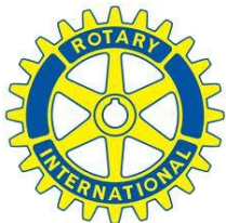
Constantia Rotary Club