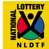
National Lottery Distribution Trust Fund

NATIONAL ARTS COUNCIL OF SOUTH AFRICA National Arts Council