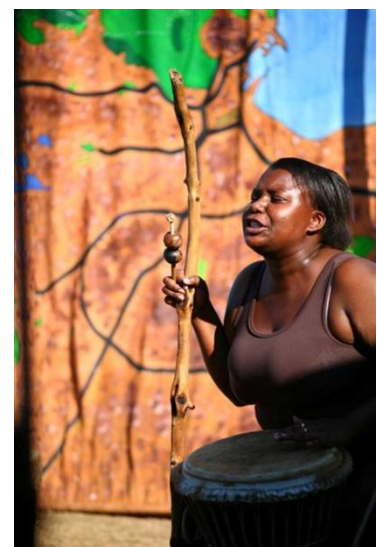
Table Mountain National Park